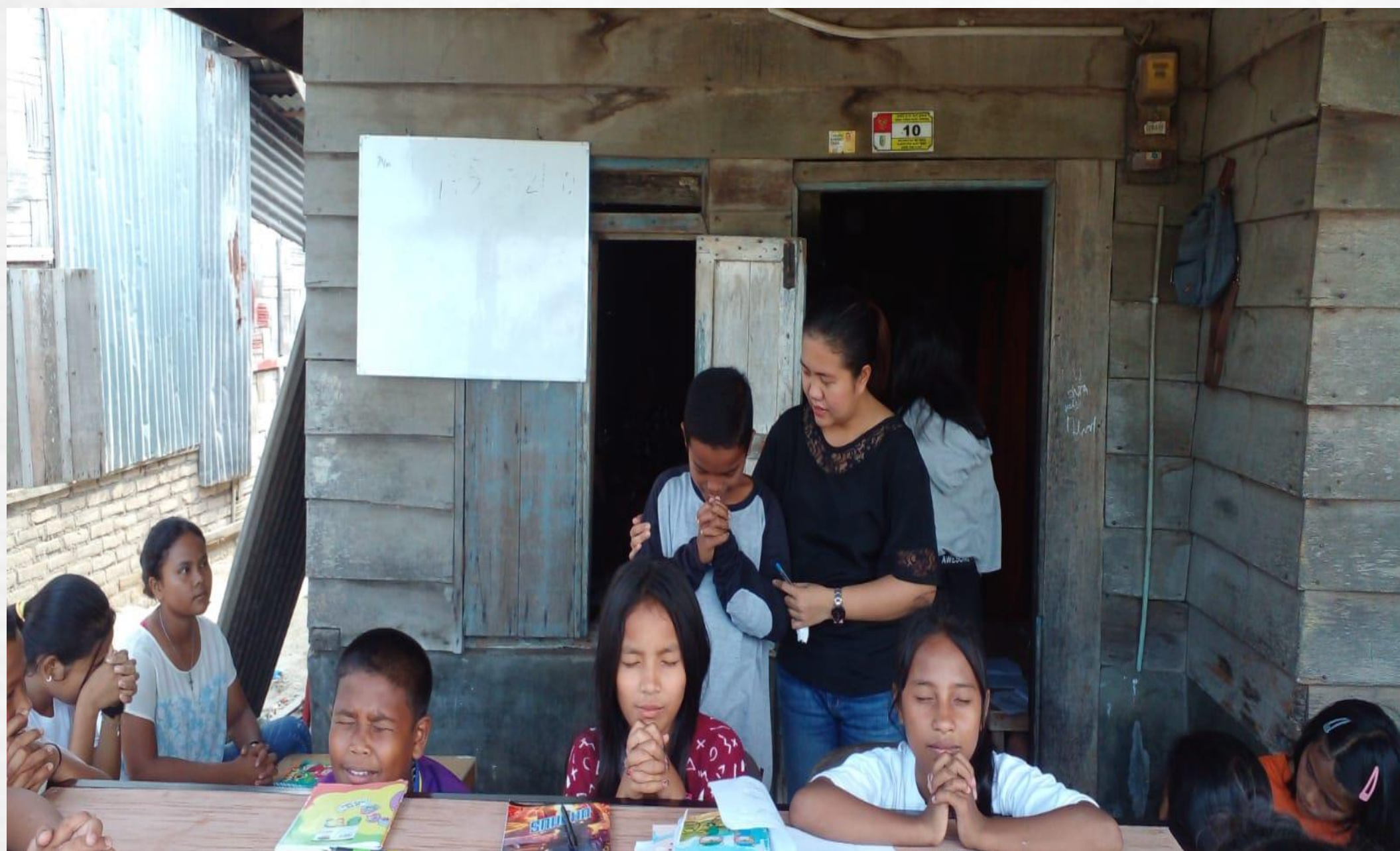
Anak Murid di Komunitas GPDI Eklesia Batubara