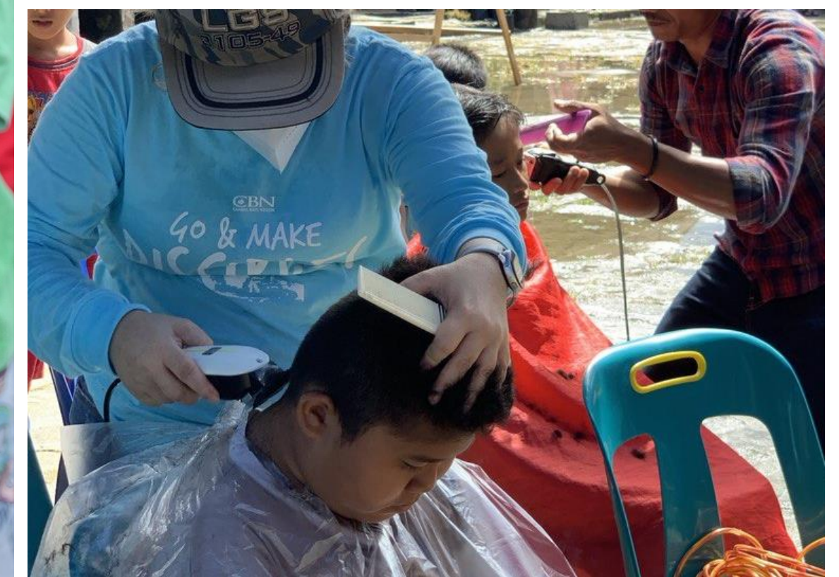
Pelayanan Potong Rambut Gratis