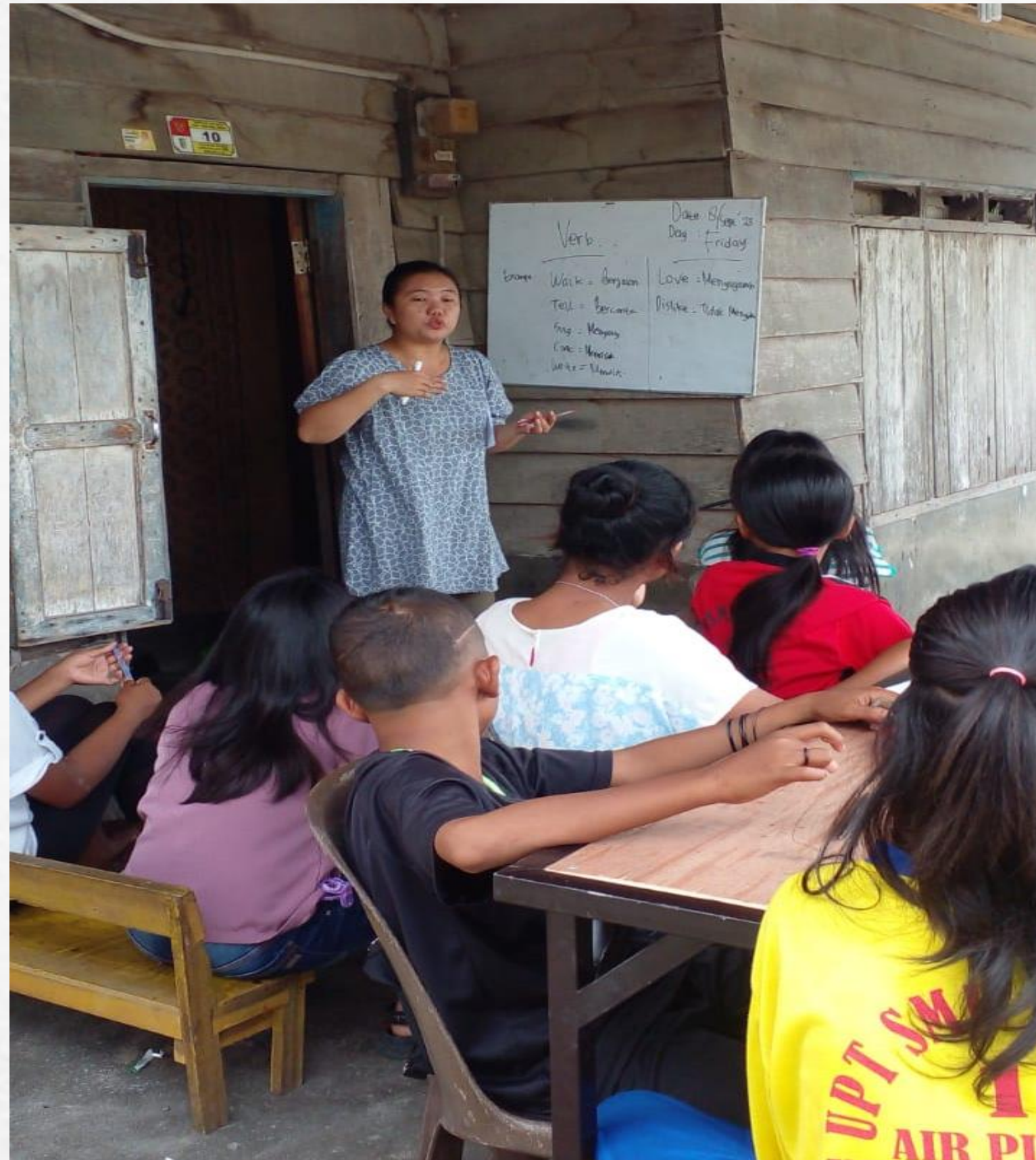
Suasana Belajar di komunitas GPDI Eklesia Batubara