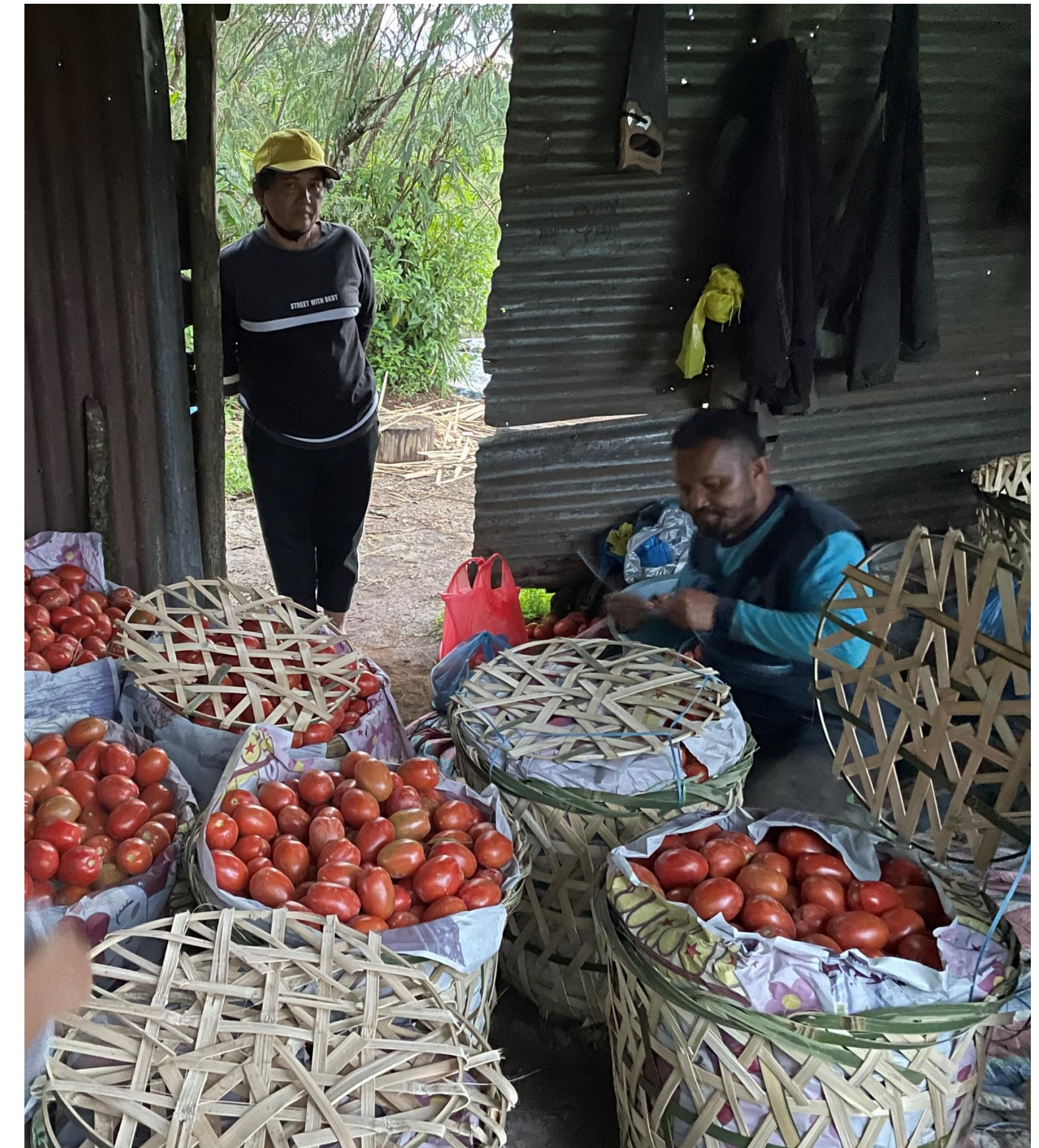
Hasil Panen Tomat dari komunitas GPMI Eirene