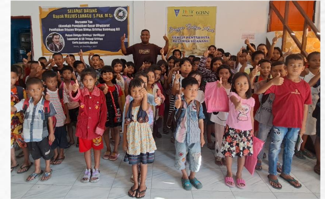
Gereja Pantekosta Belawan