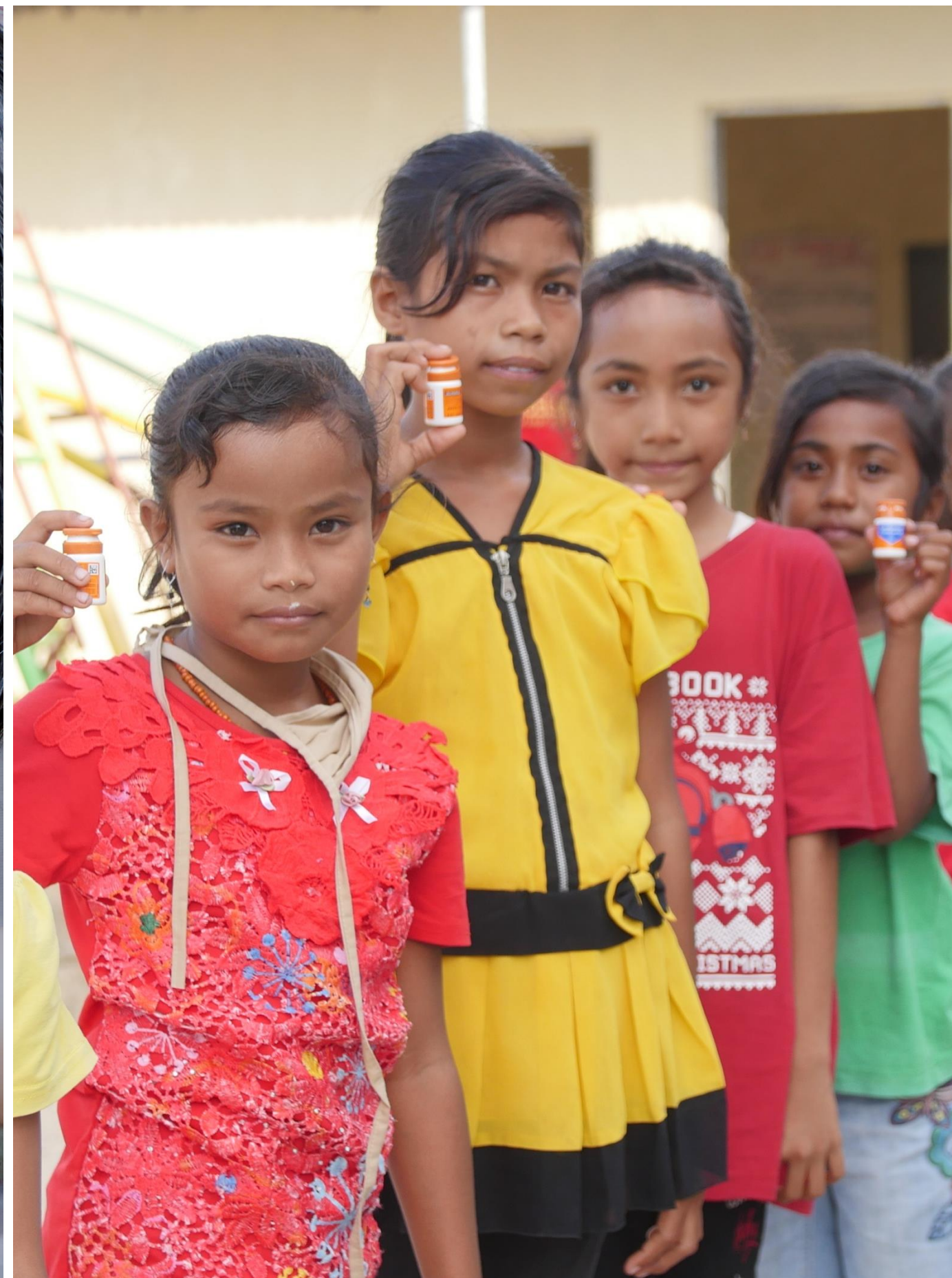
Pemberian Obat Cacing & Perbaikan Gizi