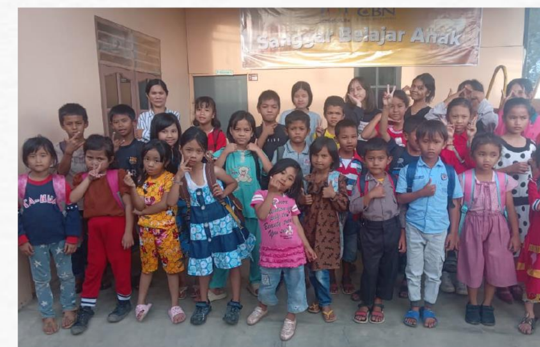
GBT KAO Sumber Mufakat