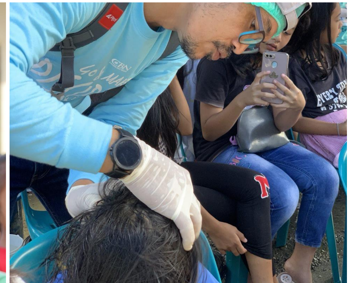
Pemberian Obat Kutu Rambut