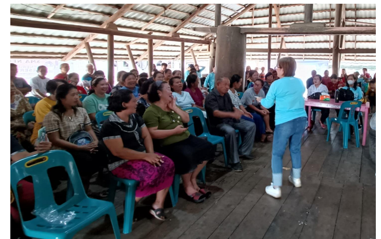
Penyuluhan parenting yang baik kepada orang tua murid dalam komunitas