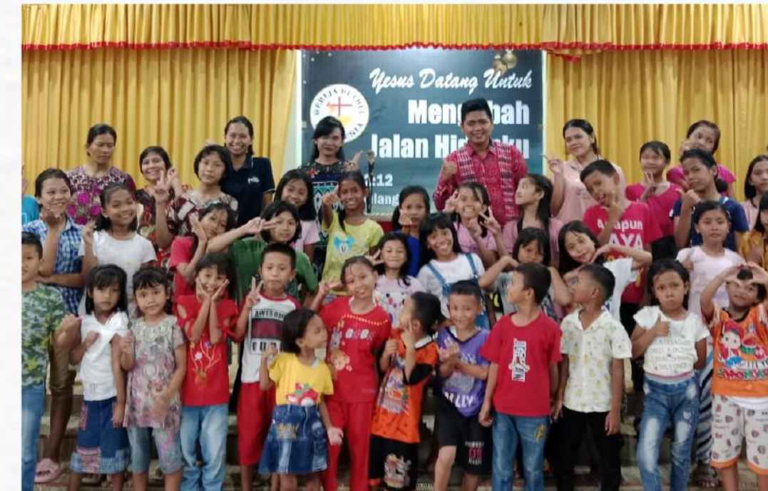
GBI Bukit Hermon