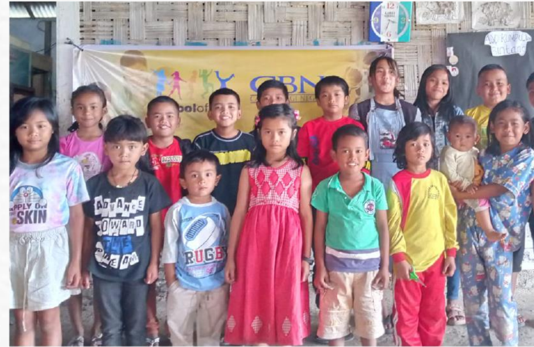
GBI Life Springs