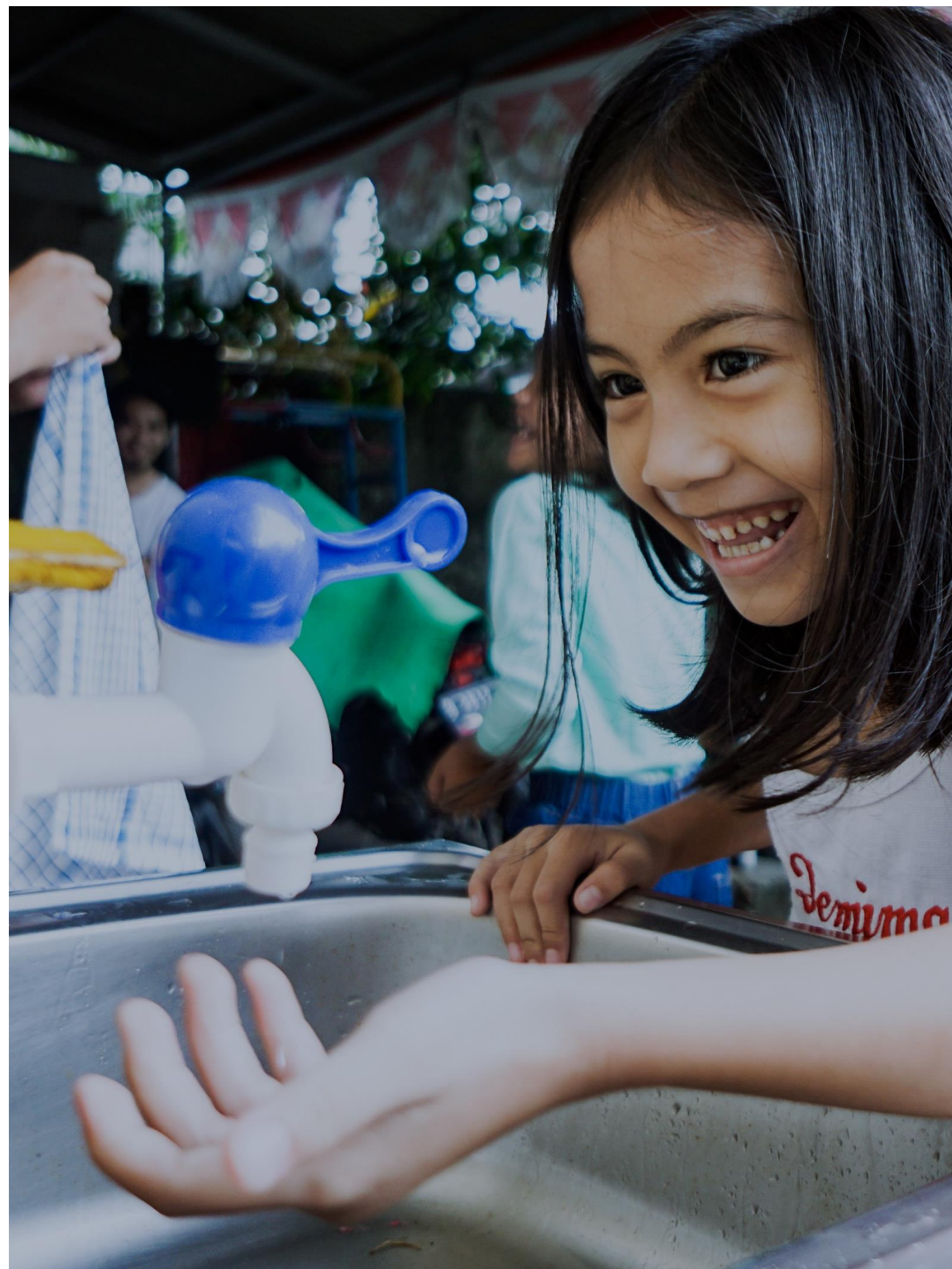
Edukasi Mencuci Tangan