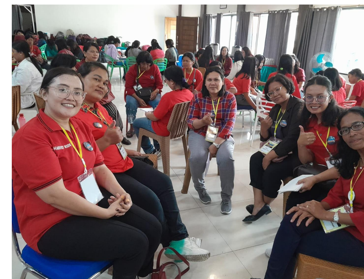
Suasana di retreat Pelayan Anak “Superteacher”